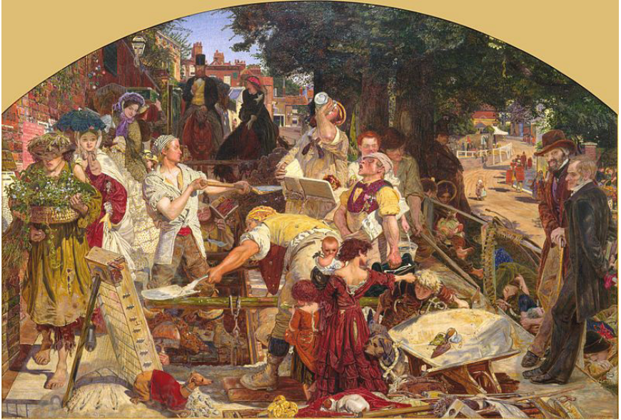
Ford Madox Brown, Work (1863), Birmingham Museum & Art Gallery